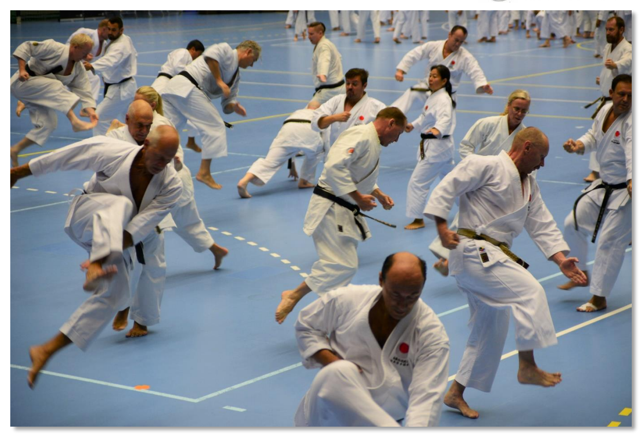
Everybody trained hard and challenged themselves in the athletic jumps in Kata.