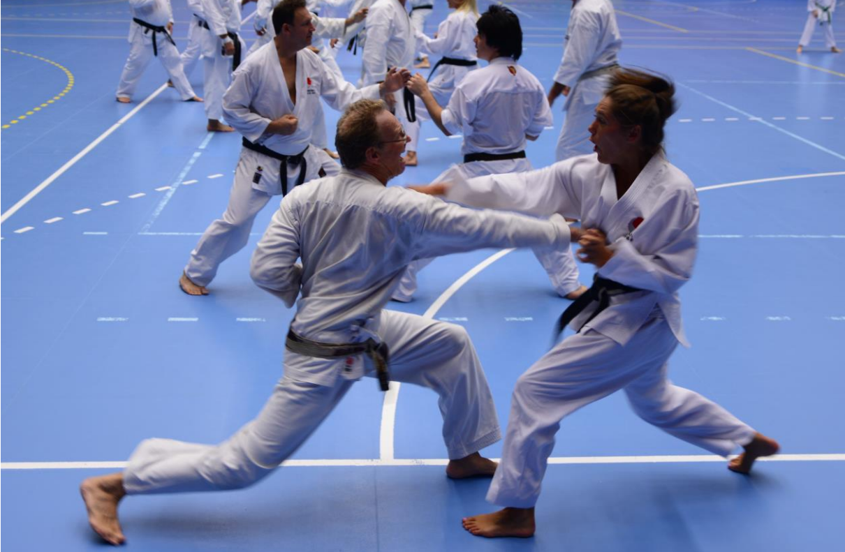
Zendokai Friday kumite also took place in Halmstad Arena.