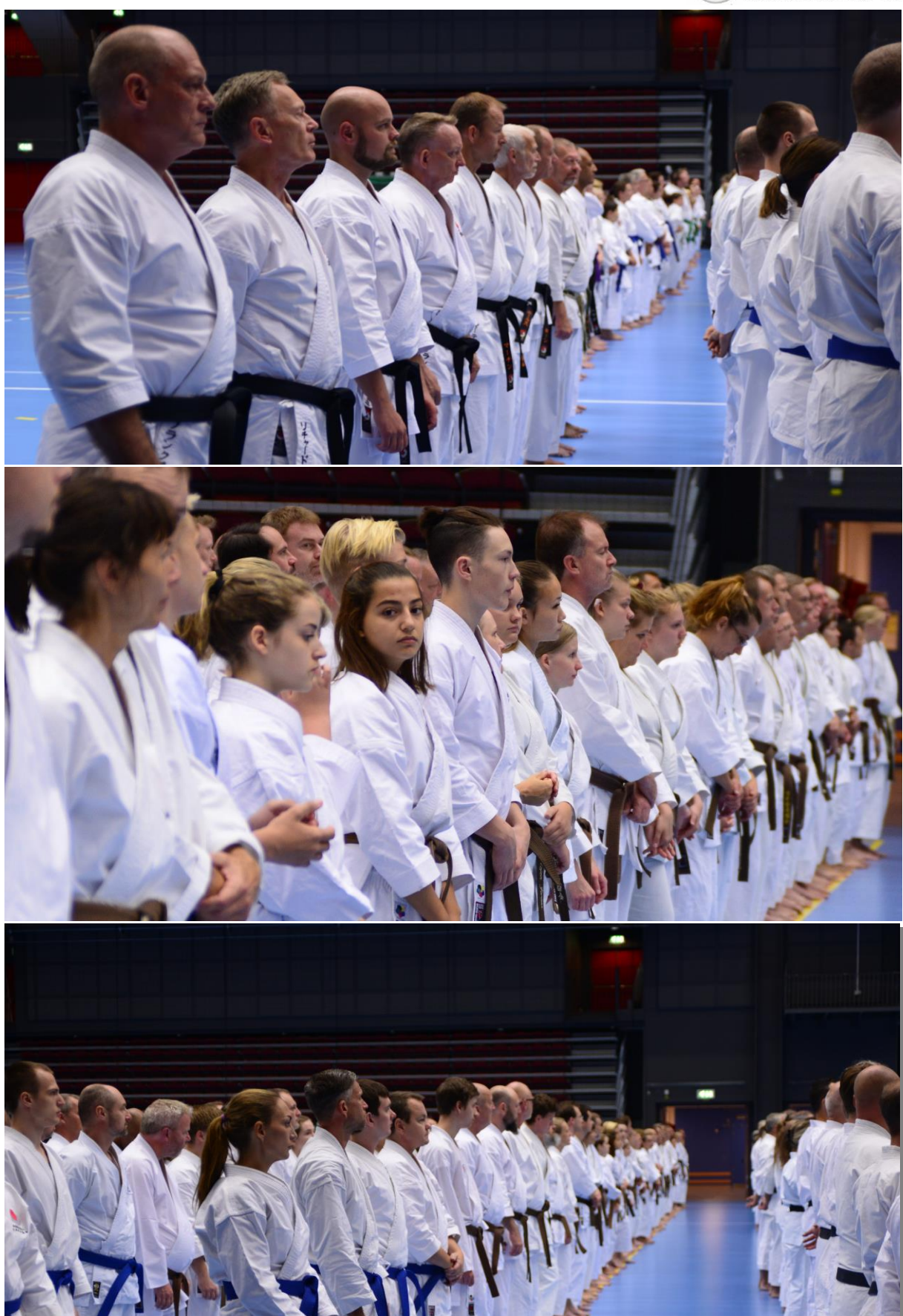
The rear rows at line-up