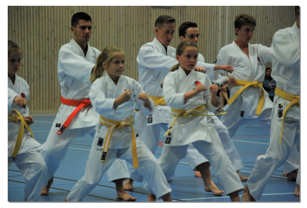
All ages showed good stamina in training.